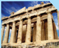
The Acropolis of Athens

ATHENS / DAILY CRUISE 3 ISLANDS (AEGINA / POROS / HYDRA)