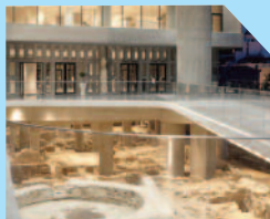
The Acropolis Museum